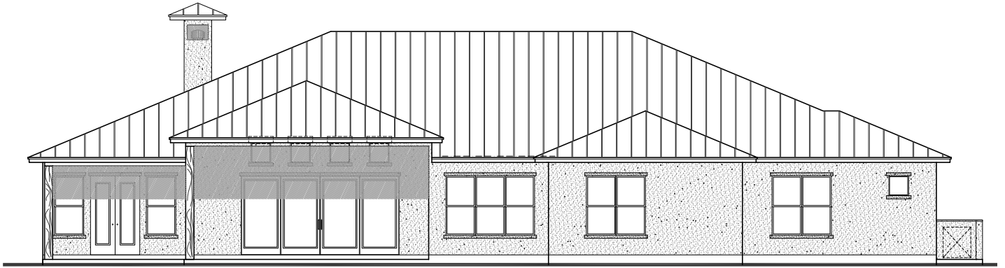
Rear Elevation SCALE: 1/4" = 1'-0"