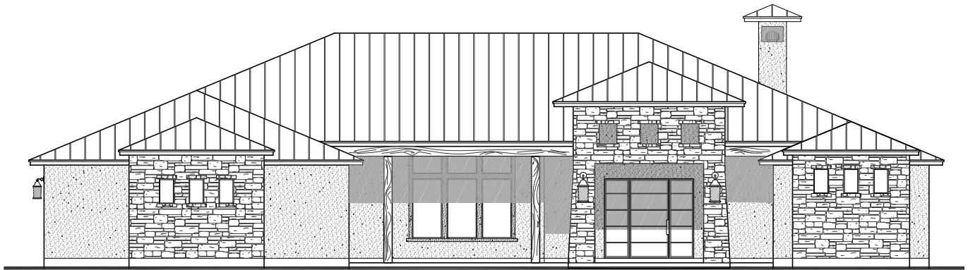
Front Elevation SCALE: 1/4" = 1'-0"