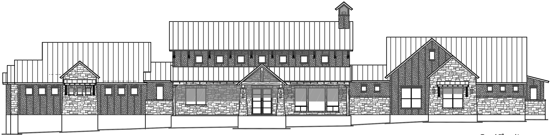
Front Elevation SCALE: 3/16" = 1'-0"