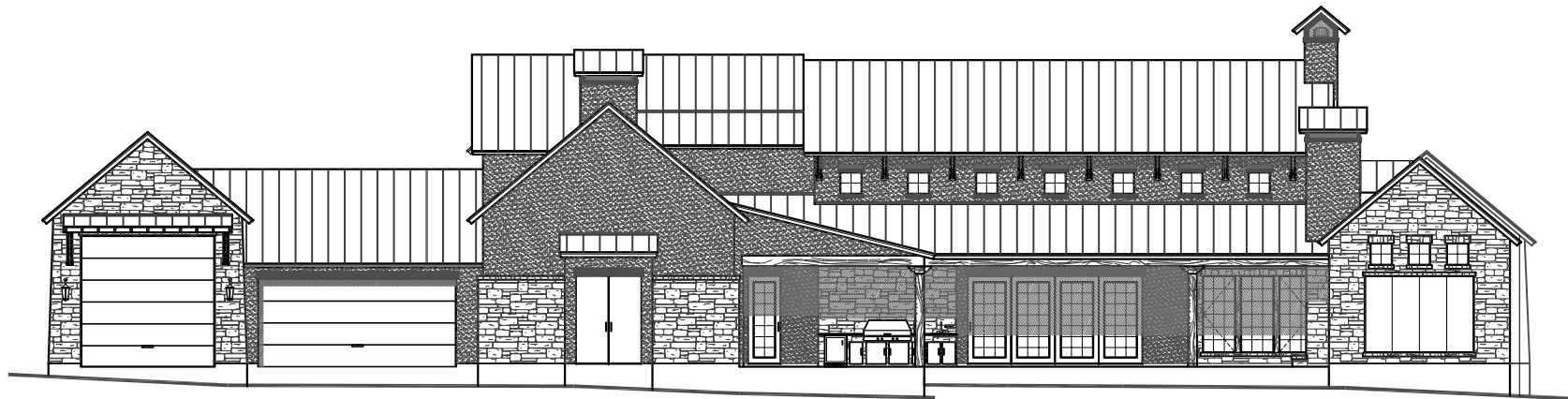
Rear Elevation SCALE: 1/4" = 1'-0"