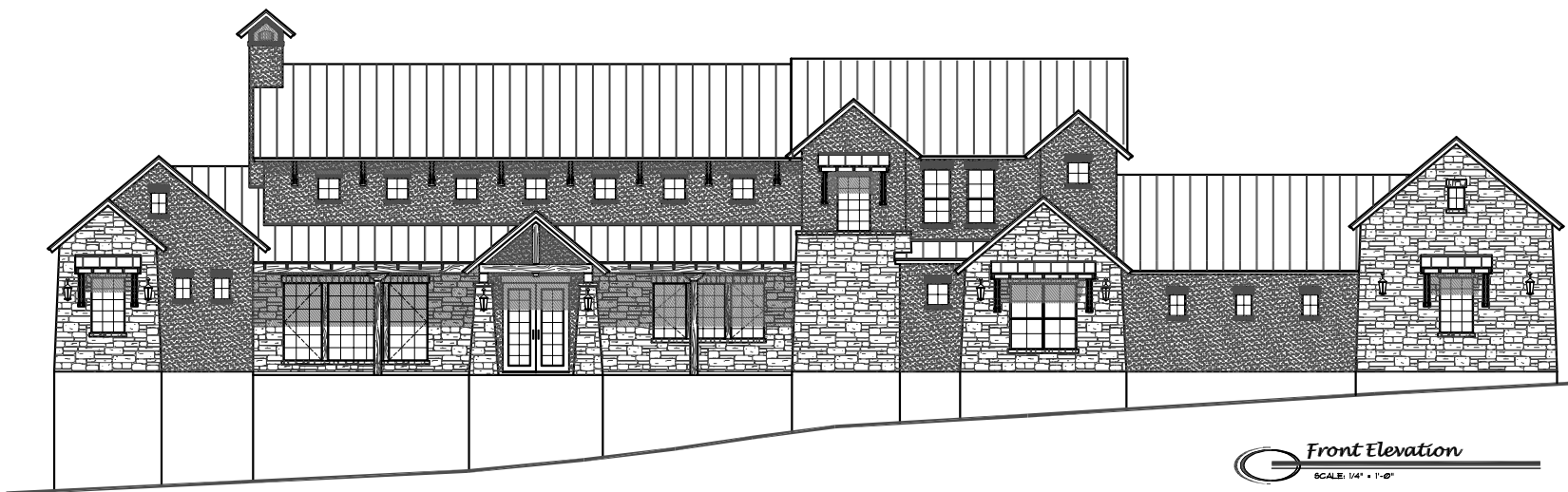
Front Elevation SCALE: 1/4" = 1'-0"