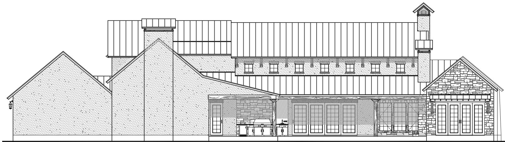
Rear Elevation SCALE: 1/4" = 1'-0"