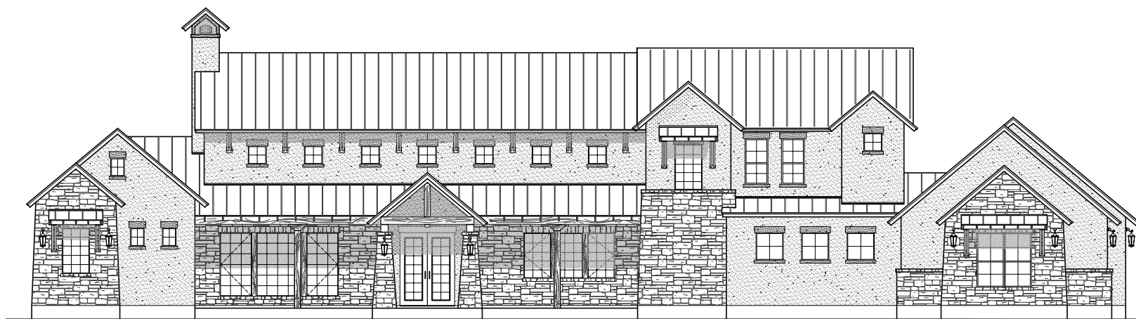
Front Elevation SCALE: 1/4" = 1'-0"